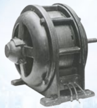
Development of a five-horsepower induction motor