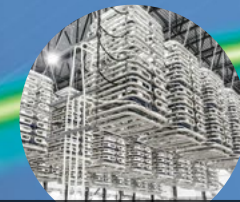
2020 Acquisition of Hitachi Energy