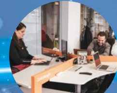
2021 Acquisition of GlobalLogic