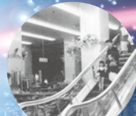
1949 Development of urban infrastructure