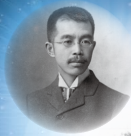
Founder Namihei Odaira