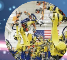
2019 Acquisition of JR Automation