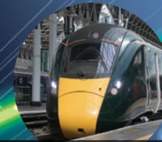
2017 Delivery of high-speed trains to the United Kingdom