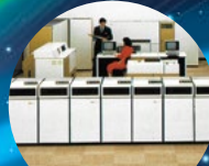
1975 Development and supply of large-scale computers